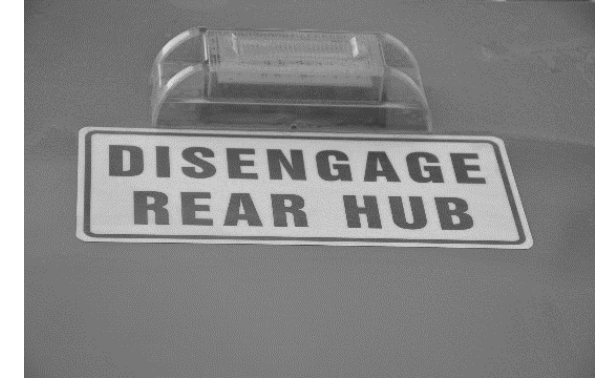
3. Open the <u>Brake Valve</u> this allows the trailer brake to function.

If the yellow light is flashing do not tow sweeper!